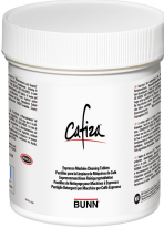
CLEANING TABLETS, CAFIZA 100T